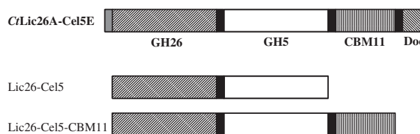
Figure 1. Domain organization of CtLic26A-Cel5A and its truncated derivatives Lic26-Cel5 and Lic26-Cel5-CBM11 used in this study. The \beta -glucanase (GH26), cellulase (GH5), \beta -glucan-binding domain (CBM11) and the dockerin (Doc) are indicated. The grey and the black boxes represent the linker sequences and the signal peptide, respectively.